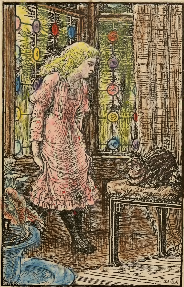
ROSY AND MANCHON.—Page 4.